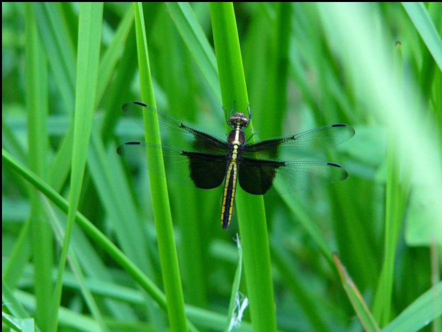
Widow Skimmer (female)