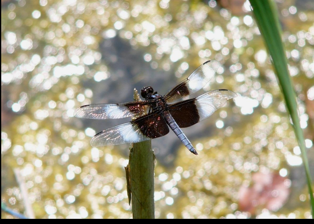
Widow Skimmer (male)